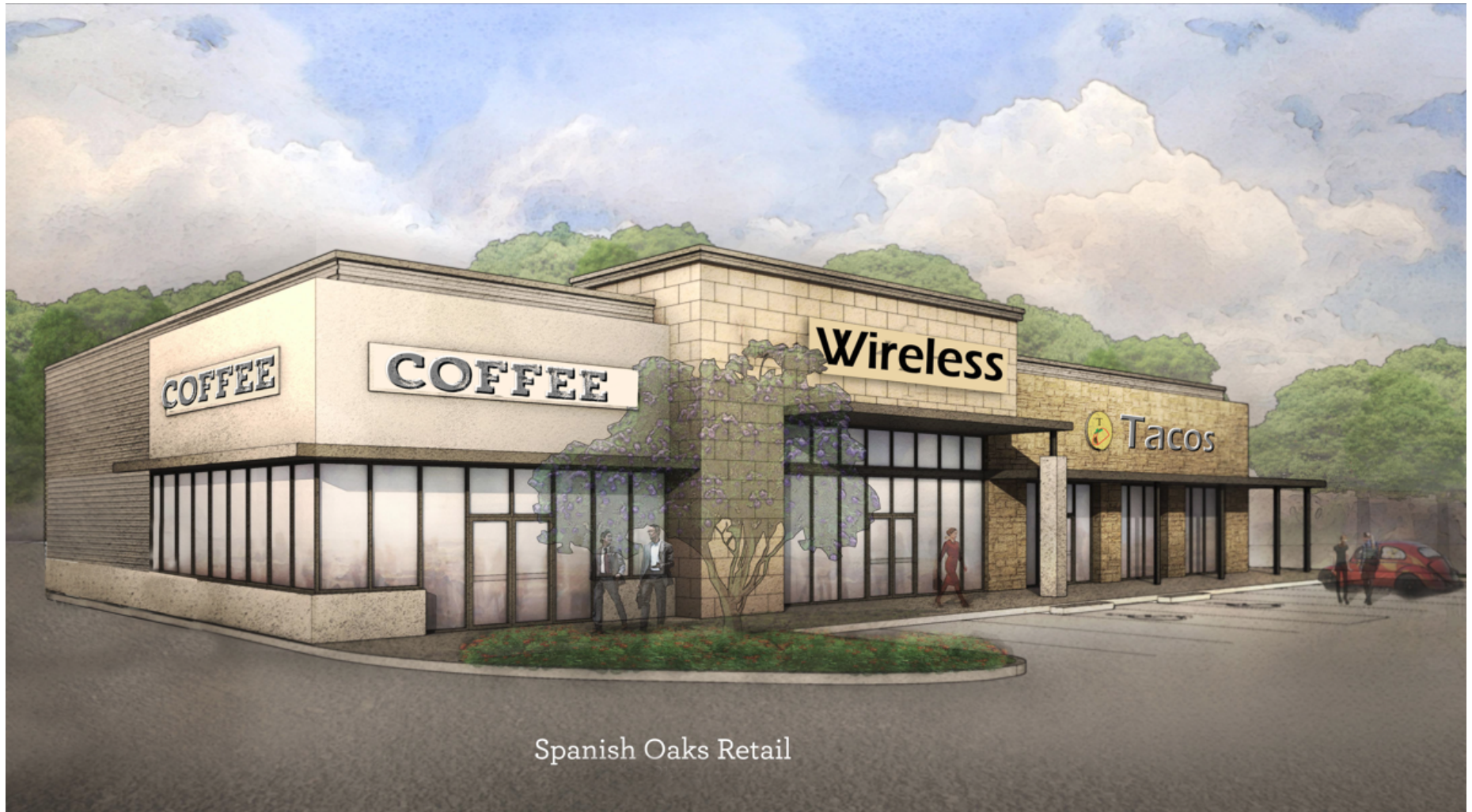
Spanish Oaks Retail